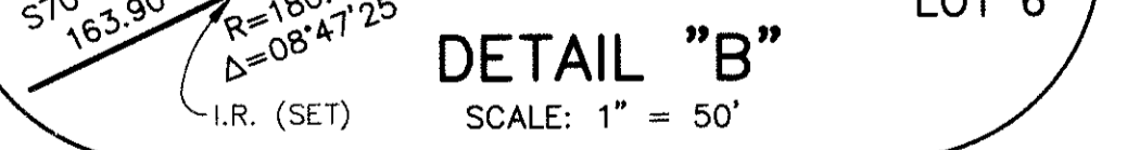
DETAIL "B" SCALE: 1" = 50'

ZONING DISTRICTS: R-1A, R-1B, HISTORIC DISTRICT & CONSERVANCY DISTRICT ASSESSORS MAP 49 LOTS 15, 53 & 54 REFERENCES: DEED: BK. 30500 PG. 500 PLANS: PL. BK. 322 PL. 52 PL. BK. 326 PL. 29 1916 STATE LAYOUT OF BAY ROAD